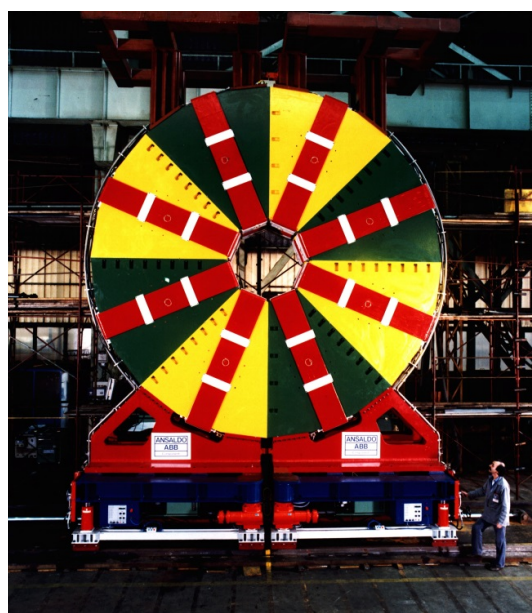
FMUON Toroids for ZEUS Experiment