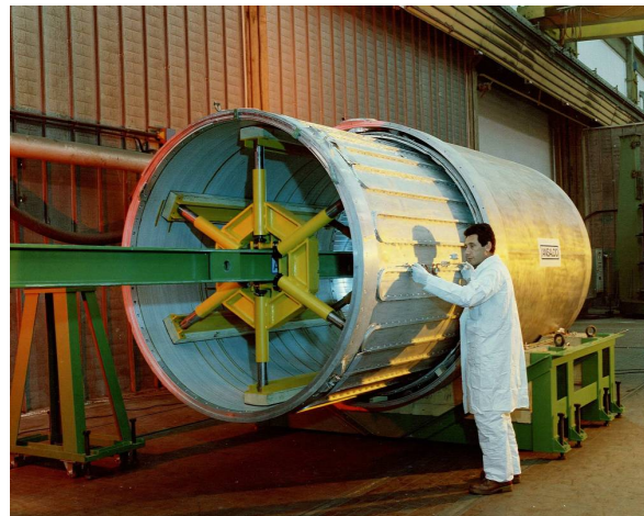
Assembly of thin solenoid

Indirect cooling through the external restraining cylinder assured an operating temperature lower than 4.5 K. The magnet showed no training behaviour.